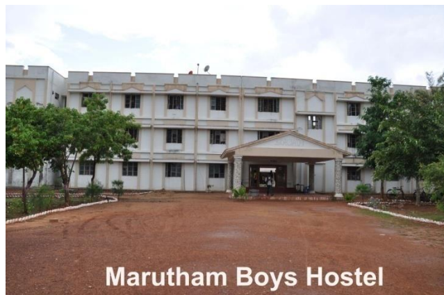
Marutham Boys Hostel